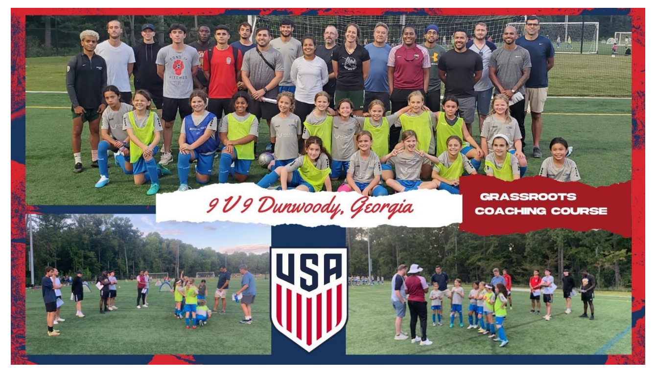
We hosted two more USSF Grassroot Courses in September, more courses hosted by Rush Union than any other organization in our area.