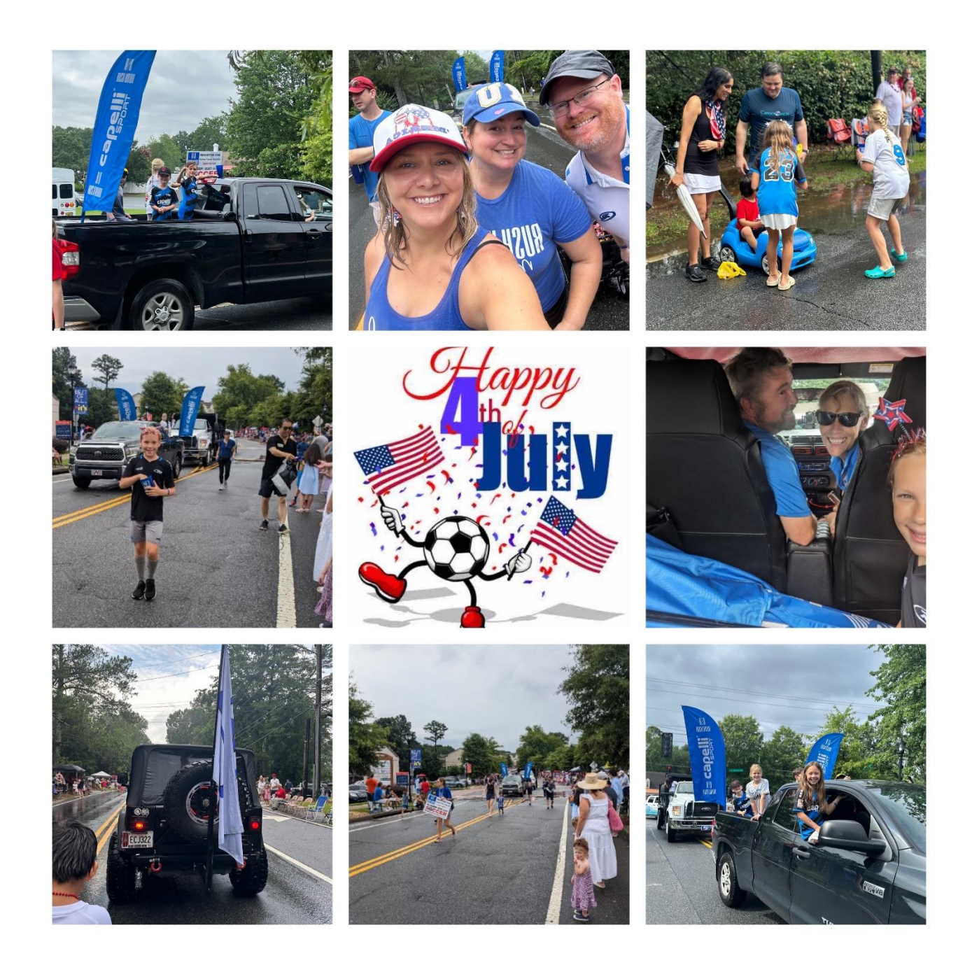
The Dunwoody July 4th Parade was a lot of fun in the rain!