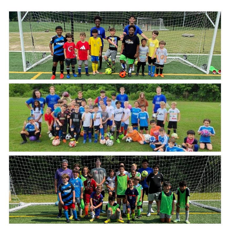
Our summer programs were a big hit, and the attendance in a variety of programs was based on feedback we had received!